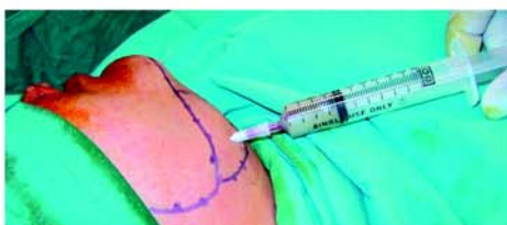
D: Aspiration of pus from Patient in B.