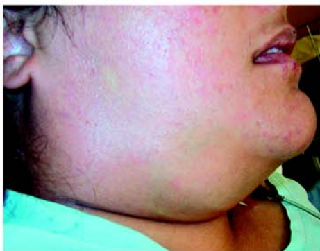
B: Right submandibular swelling secondary to an abscess of the lower right second molar tooth (case not described here but similar to Patient 4).